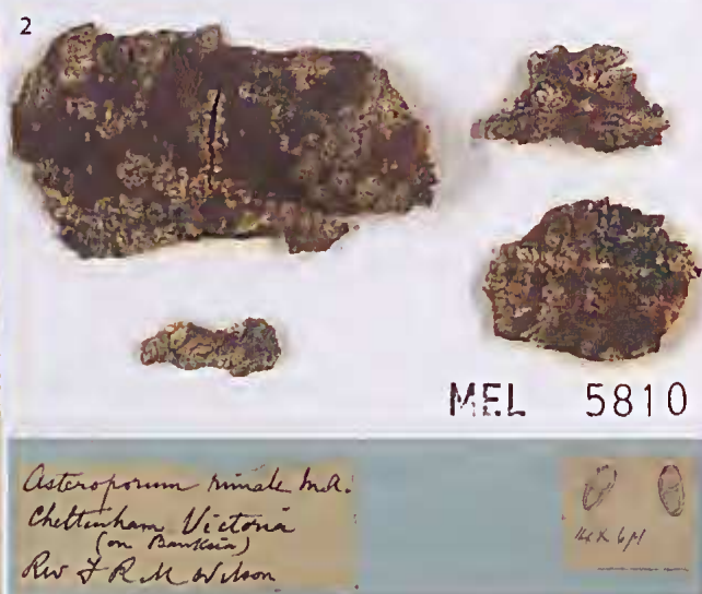
Figure 1. Lectotype of Arthonia banksiae Müll. Arg. (G).